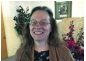
Coral - Gladwin