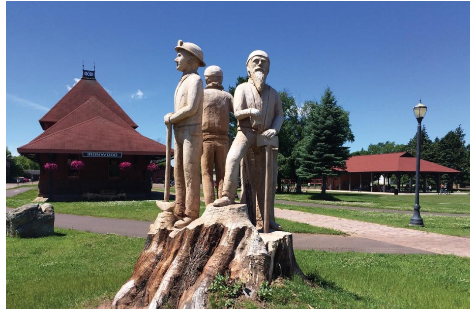
Three Men & the Ironwood Depot

Now for the God thing! Between the amount the anonymous donor gave and the amount the congregation gave, it was the "exact amount needed" to purchase the radio station! Exact! Besides that, the members have pledged a monthly amount needed to help run the radio station after we begin broadcasting! Praise God!